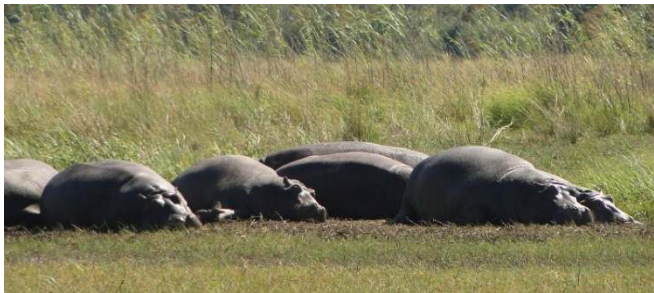
Hippo's sunbathing at Wasa

The Kasanka School is going well. Forty children enrolled for 2011. The children provided entertainment during the Bicycle race; singing and dancing for the contestants. They have also helped to collect wild tree seeds around the Conservation Centre, for community members to plant as seedlings. The two Kasanka school teachers went on a New Breakthrough to Literacy course in April, funded by Kathelijne Children Funds.