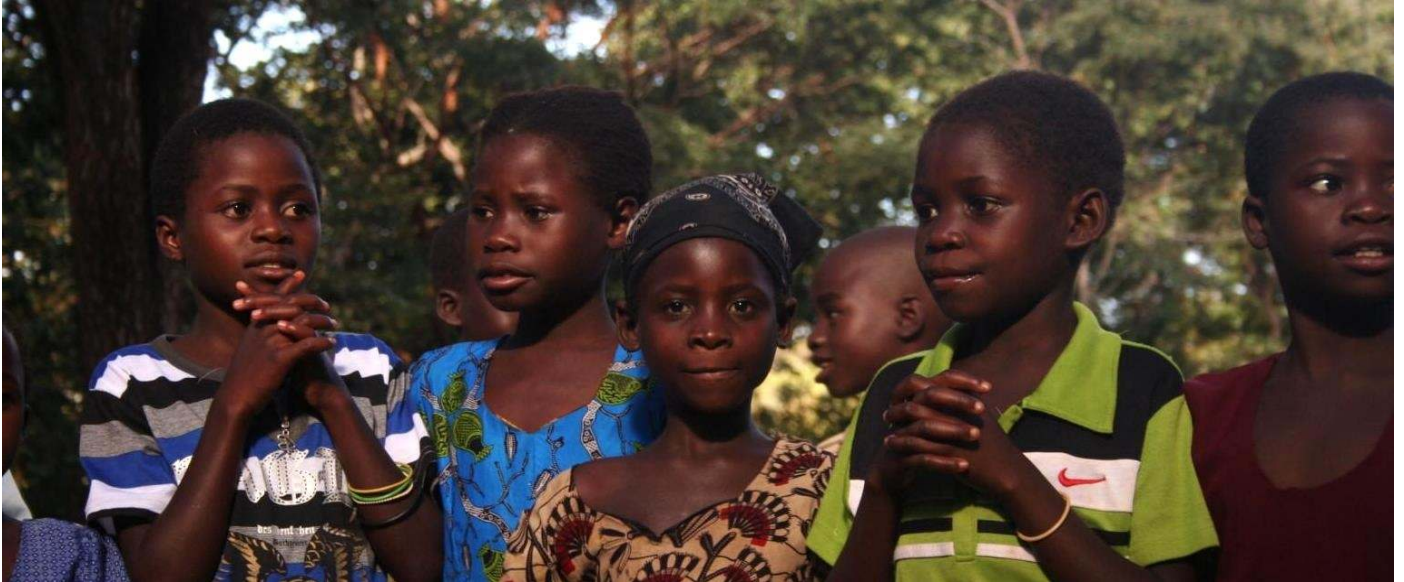
Kasanka school pupils during the bicycle race