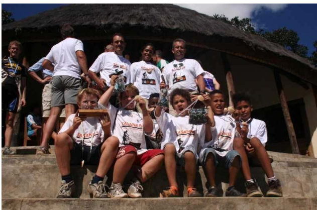
Some of the bicycle race contestants