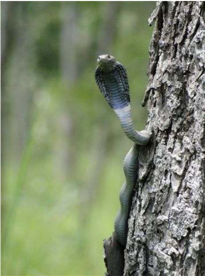
Black-necked spitting cobra, Kasanka

A recurring, big scale activity in the park is the so-called “early burning”. This is undertaken to lessen the risk of “late season” fires, which can be more harmful and damaging to the flora and fauna. This year it was sponsored by the Kasanka UK Trust and two teams have been working steadily for the last two months. They have paid special attention to the sensitive bat forest area, where a newly designed system of firebreaks has been implemented to facilitate forest expansion.