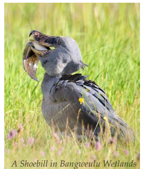
A Shoebill in Bangweulu Wetlands

150 kilometers to the north of Kasanka, Shoebill Island camp is situated in the heart of an extraordinary wildlife area known as the Bangweulu Wetlands. The Kasanka Trust is privileged to operate this camp as the only tourist accommodation in the area, and has supported conservation here for over 20 years. From Shoebill Island, you will set off by boat or foot to spot the elusive Shoebill amongst a plethora of local birdlife. Game drives are also offered to take you past herds of endemic Black Lechwe numbering in the tens of thousands, as well as Tsessebe, Oribi and a range of other wildlife.