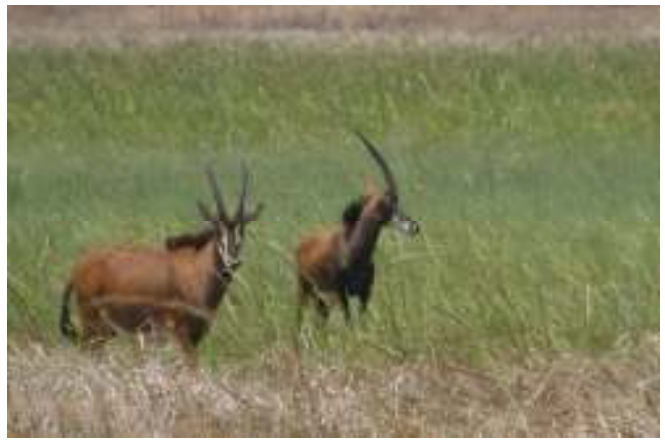
Sable antelopes at Wasa III