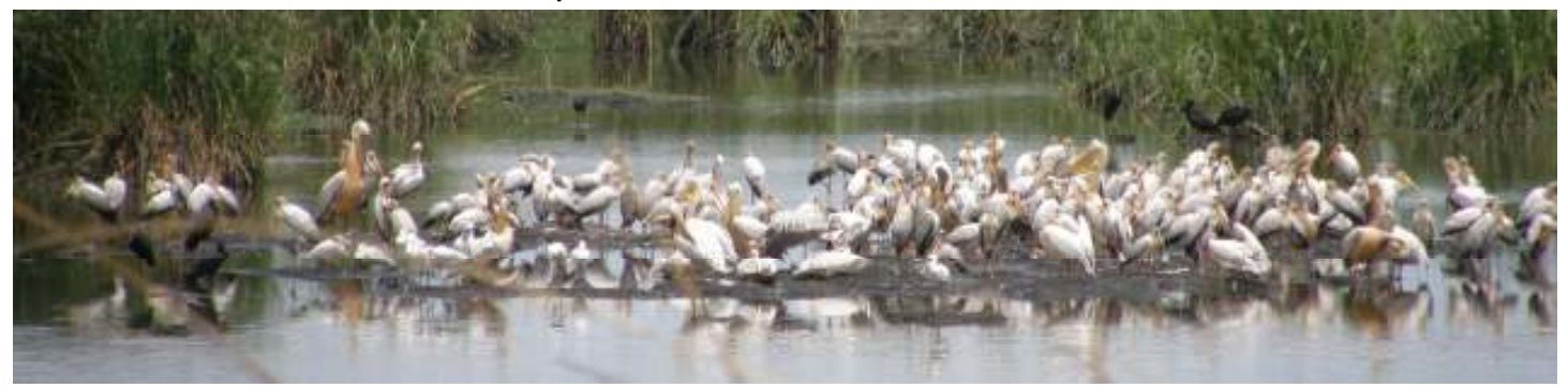
Pelicans, storks and other waterbirds at Kapabi

Overall this was a productive quarter with good antipoaching results and tourism income. The main challenges remain control of poaching and directly related to that, sourcing funding for core management activities and overheads to continue through the low season. The Kasanka team is full of energy to make it happen in 2010 with the help of our friends and supporters!