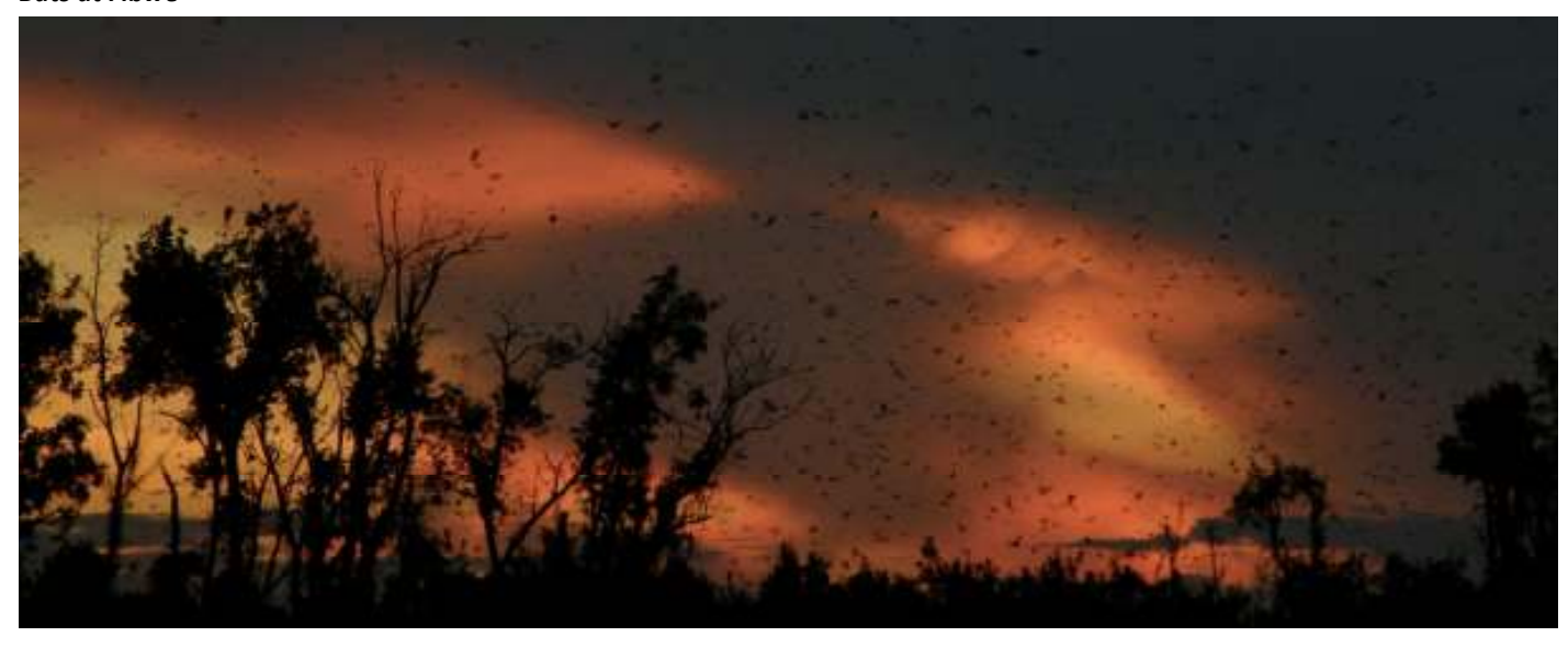
Bats at Fibwe

The bats arrived and left again, Lake Wasa is filling up, the fields of Pijama Lilies are stunning and the elephants have given birth to many baby nsofu's : the start of the wet season is really exciting and amazing!