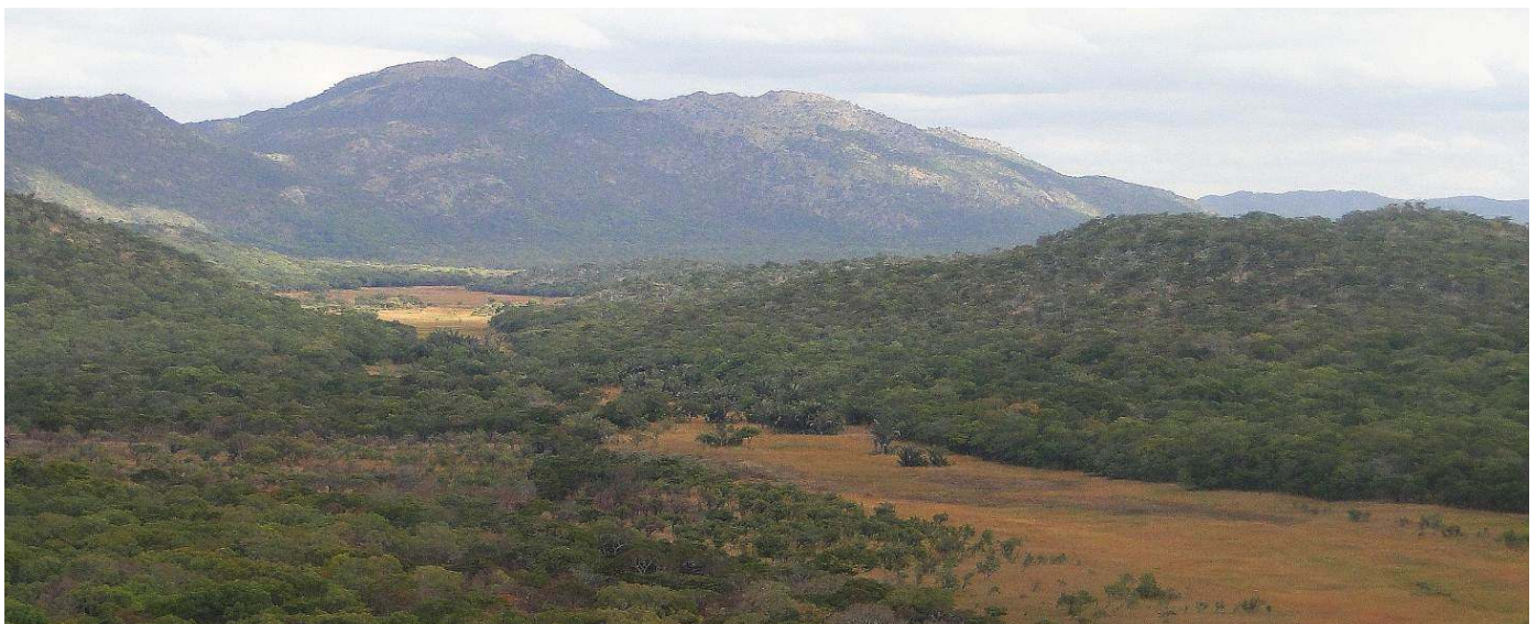
Malawuzi dambo in the central Lavushi Manda mountains