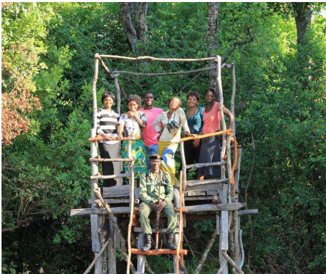
Science club on bat forest field visit

Simba was the first school group in many years not to lose at football to Chitima Community school, coming away with a very creditable 2 – 2 draw!