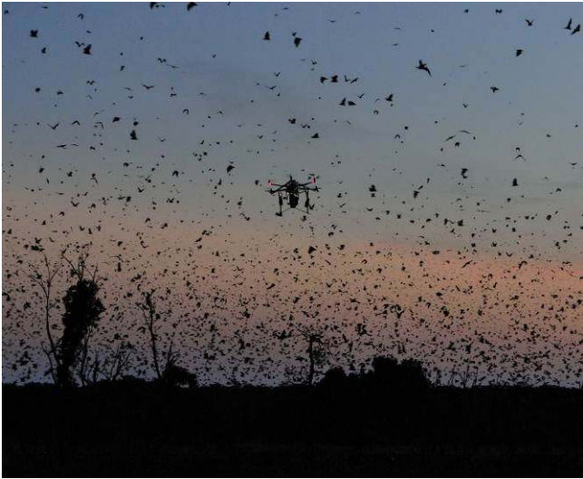
Filming the bats using a hexacopter

It's currently The Year of the Bat , which no doubt encouraged a number of other specialist organisations such as a group from the Bat Conservation International to pay us a visit. BCI and Kasanka are now working on a partnership!