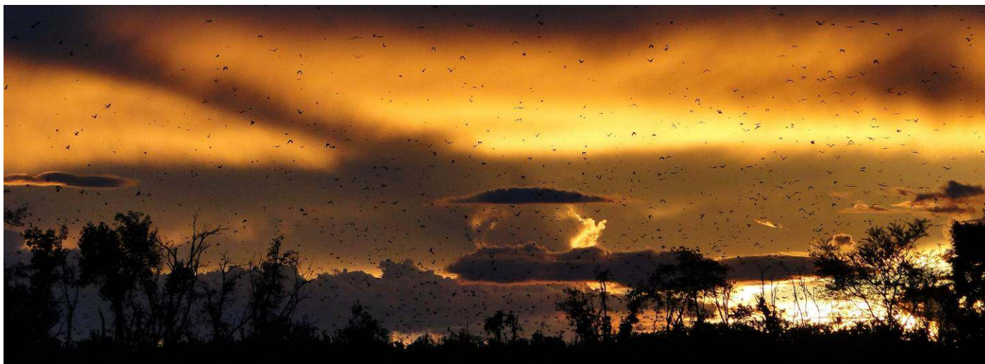
Another spectacular bat season at Kasanka National Park

With the arrival in November of our new project manager work has now started in earnest at Lavushi Manda National Park. A temporary base has been established at Africa Parks HQ in nearby Nkondo and great strides have been taken to upgrade the main access roads. Work starts soon on a permanent base within the park and a picturesque location for the park's first campsite has been identified. Key stakeholder liaison is going well and we are already seeing a significant improvement in anti-poaching results.