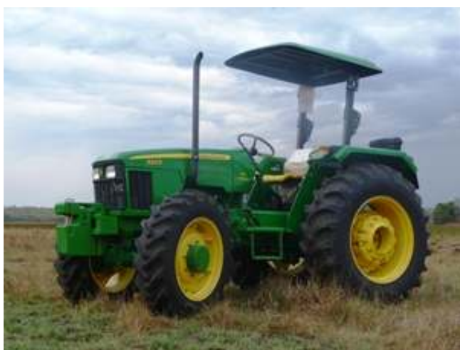
Lavushi Manda's new tractor hard at work grading existing roads

With the arrival in November of our new project manager work has now started in earnest at Lavushi Manda National Park. A temporary base has been established at Africa Parks HQ in nearby Nkondo and great strides have been taken to upgrade the main access roads. Work starts soon on a permanent base within the park and a picturesque location for the park's first campsite has been identified. Key stakeholder liaison is going well and we are already seeing a significant improvement in anti-poaching results.