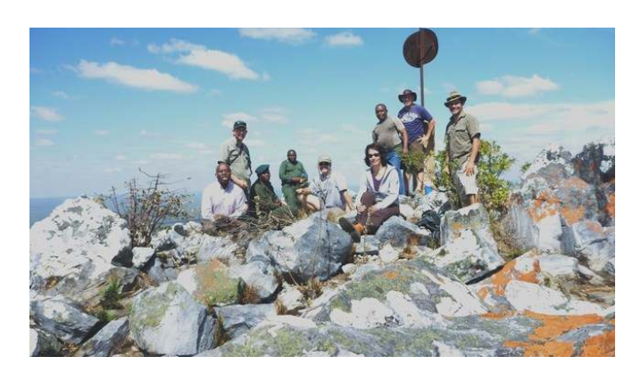
World Bank, ZAWA and Kasanka delegation in Lavushi Manda

This coming period the team will focus on constructing a temporary office site and campsites at Kanyanga Falls and the spectacular Kapanda Lupili Fall.