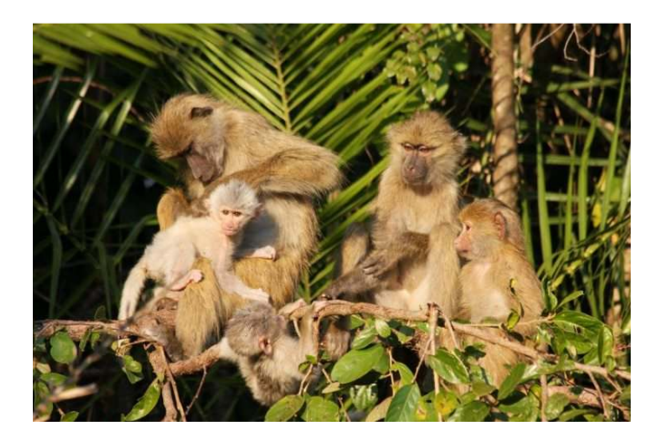
The Kinda Baboons

Now that the tall grasses of the Chipya have been largely burned, the Kinda Baboons of the Kasanka Baboon Project have proved easier to find. They have several babies at the moment, some of which are bright white.