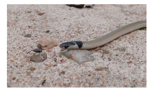
Cape Centip ede Eater

The Chinyangali bridge has been repaired, allowing better access to the Bupata area. The construction of Bupata scout post near the bat forest, to fight poaching in this hotspot and prevent fires, will be initiated soon.