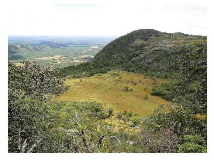
Lavushi Manda panorama

A group of American and Canadian students came after visiting Kasanka National Park to pioneer a hike across the escarpment in Lavushi Manda National park. It proves to have amazing potential. Along the way, several reptile and amphibian species were recorded and scores of grasshoppers collected for proper identification. Red-Rock Rabbit, Baboon and Klipspringer were seen, and the fresh spoor of Leopard, Lion, Hyena and many ungulate species encountered. Scouts report fairly regular sightings of Reedbuck, Bushpig, Roan and Sable, and Lion are frequently heard in several locations.